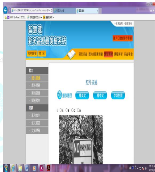
Picture 3 Online Listening Practices