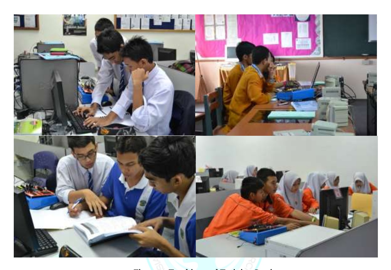
Figure 2: Teaching and Training Session

means they do not have any programming background. The effectiveness of the teaching and learning package are measured by comparing the performance of the two groups. Will the group without programming background performed at par with the group with programming background?