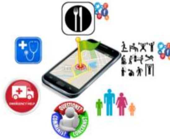
Fig. 2. BIG-GLUCON-HERO