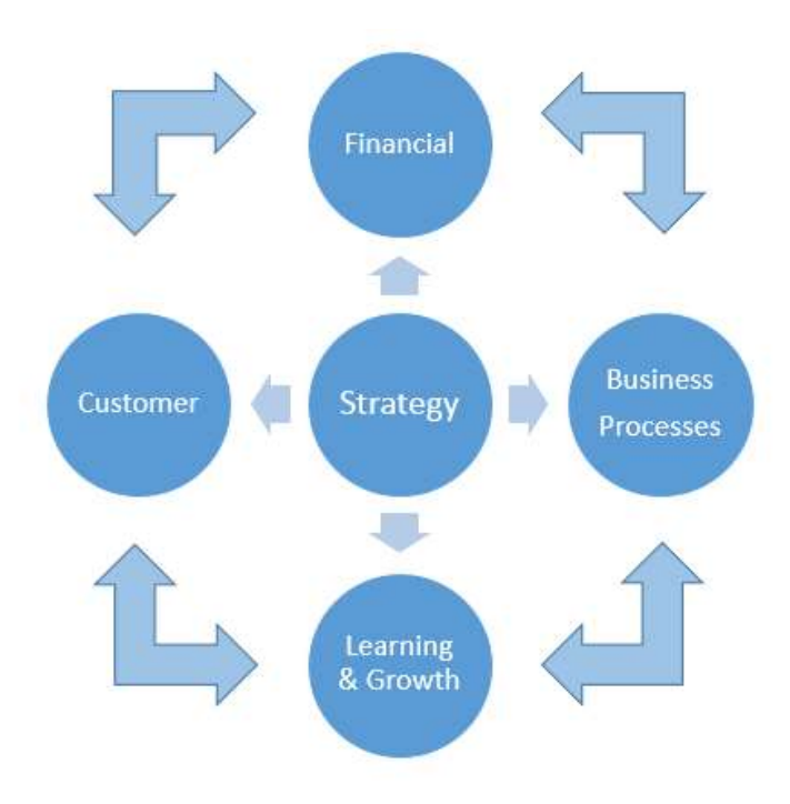
Figure 1: BSC Perspectives(Kaplan, 2010)

In the past, performance management system mostly only consider about the financial perspective, but BSC not only measure through the financial perspective but also stakeholders, internal process and learning and growth of the company. BSC framework is depicted in Figure 1.