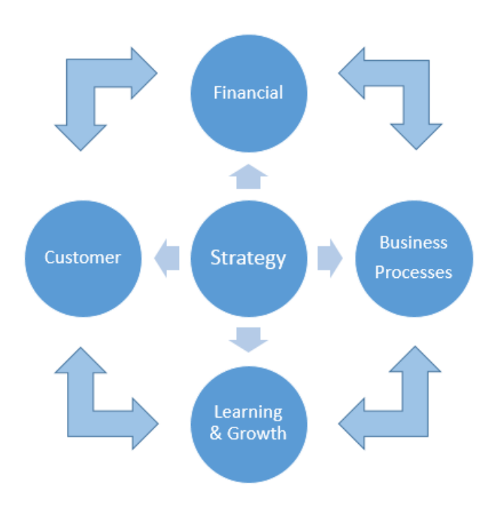
Figure 1: BSC Perspectives(Kaplan, 2010)

In the past, performance management system mostly only consider about the financial perspective, but BSC not only measure through the financial perspective but also stakeholders, internal process and learning and growth of the company. BSC framework is depicted in Figure 1.