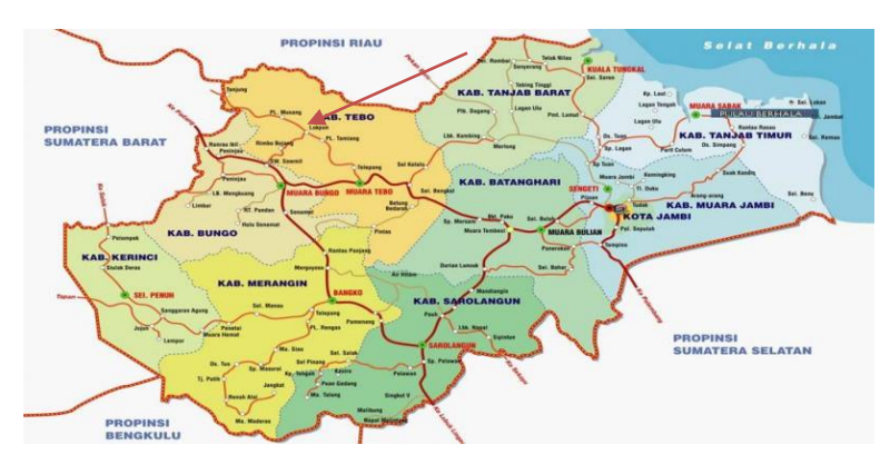
Figure 2: Geographical location of Tanjung Jabung Barat

Figure 2 shows the location of Tanjung Jabung Barat Regency. The respondents of this study are taken from the four villages at Tanjung Jabung Barat in order to identify their socio-economic profile as well as the determinant's participation of farmers on empowerment program which is in line with the objective of the study.