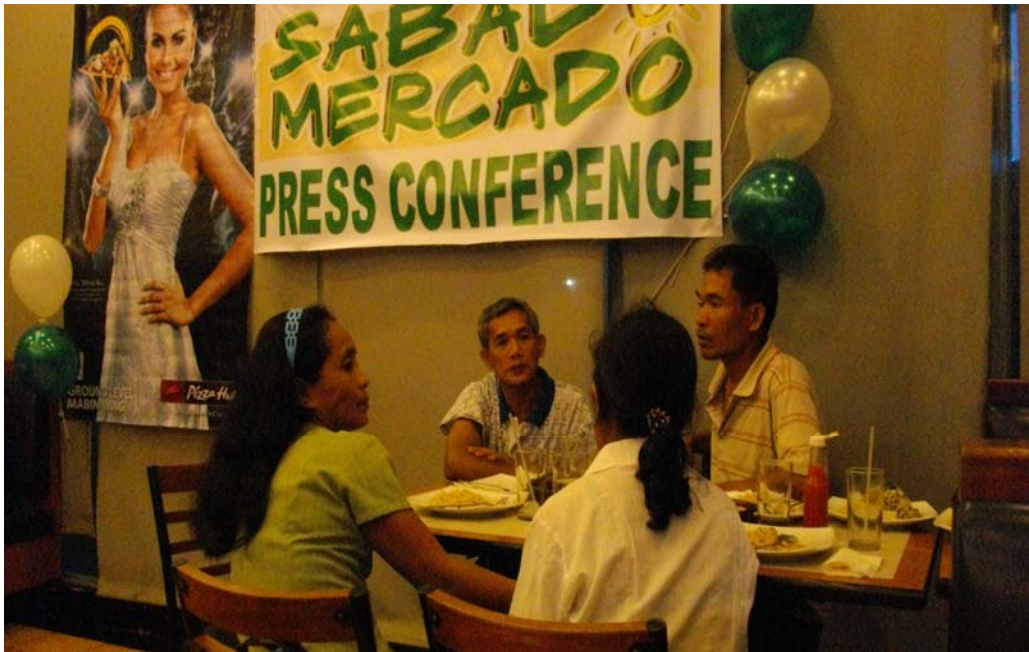
Press Con for the Launching of Sabado Merkado at Robinsons Place Iloilo