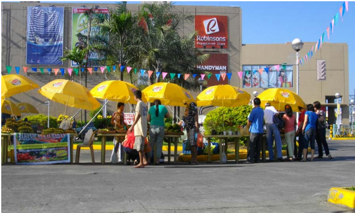
Sabado Merkado (weekend organic market), Robinsons Place Iloilo

From production to marketing (Bahandi sa Kaumhan, a social enterprise put up by former combatants)