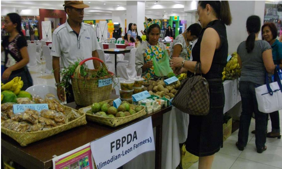
Bringing advocacy to the malls: Amigo Mall, Robinsons Place Iloilo, and the Atrium.

The continuing journey to peace and development explores other modalities to achieve this. Reconciliation and revisiting the struggles of the past to chart the new hope for the future was conducted through Pagpasag-uli (Reconciliation).