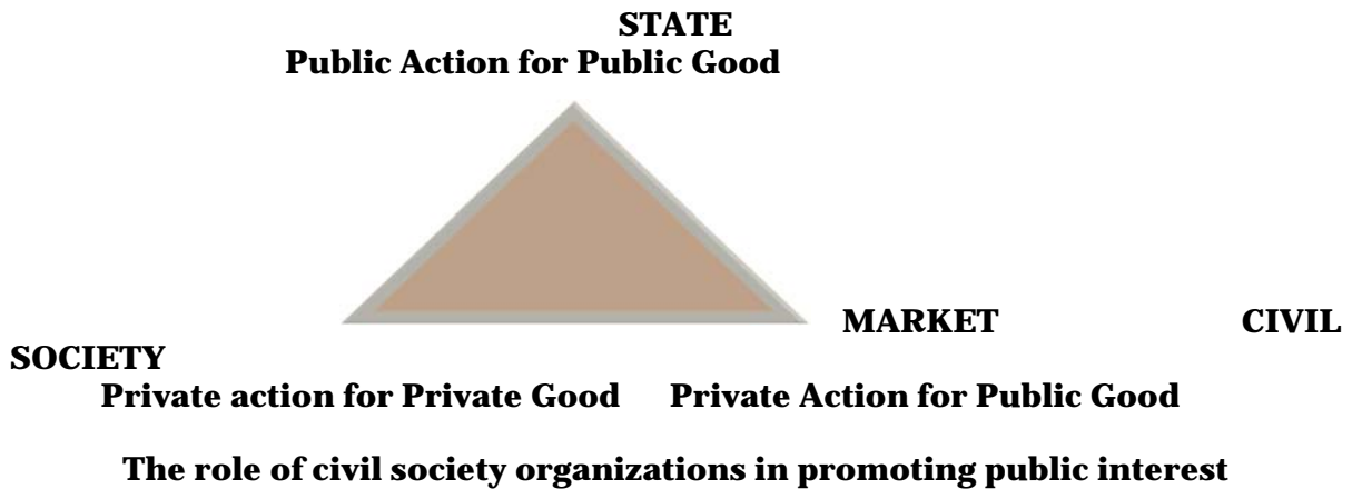
Figure 1. The state, the market and the civil society

Everything is interconnected and could be better appreciated and understood through the systems perspective or the General Systems Theory – particularly interdependence and symbiosis concepts. (Figure 2)