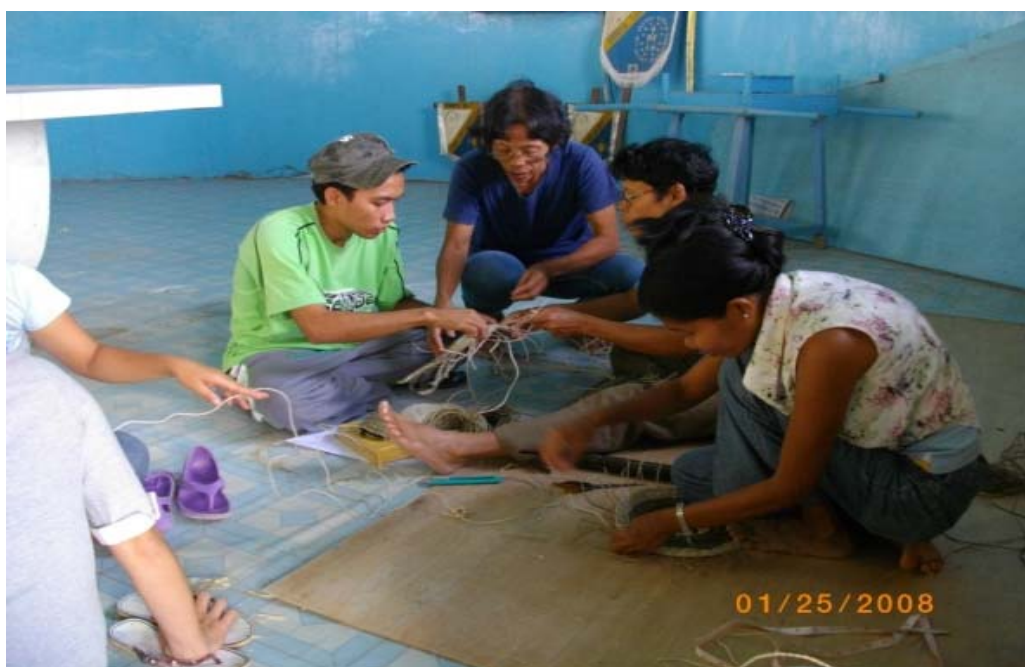
From rebellion to peacebuilding through livelihood project (Binhi sa Buwas-damlag/Seeds for the Future)