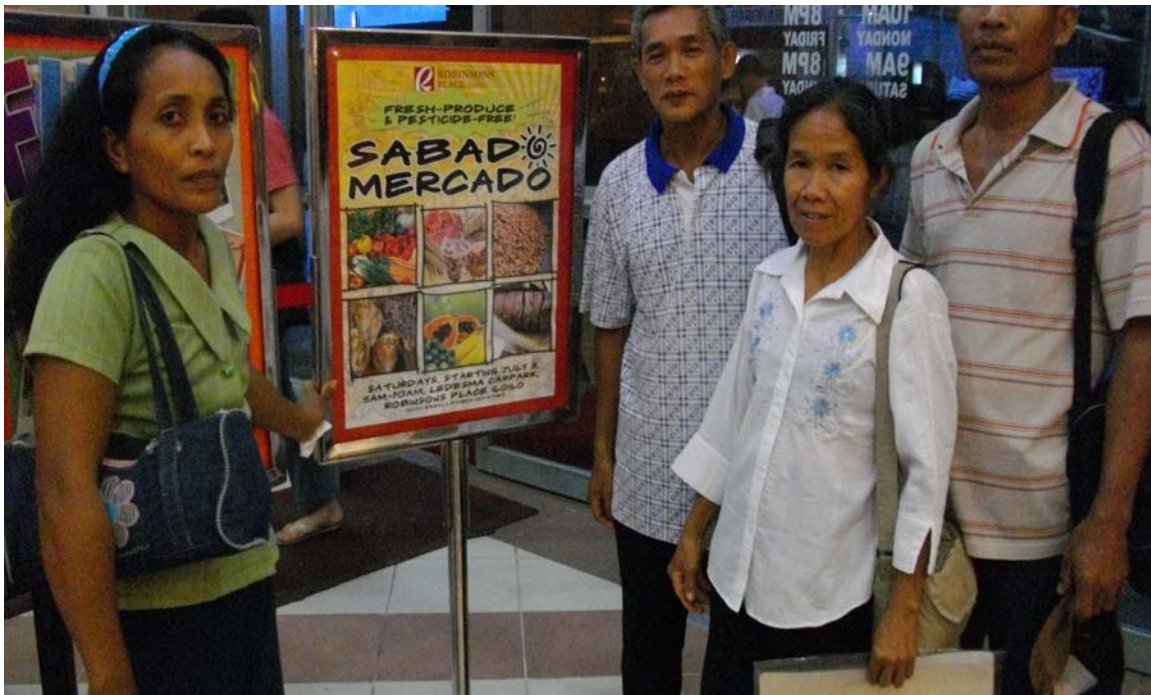
Bringing the advocacy for peace and development from the mountains to the Mall on the launching of Sabado Merkado at Robinsons Place Iloilo