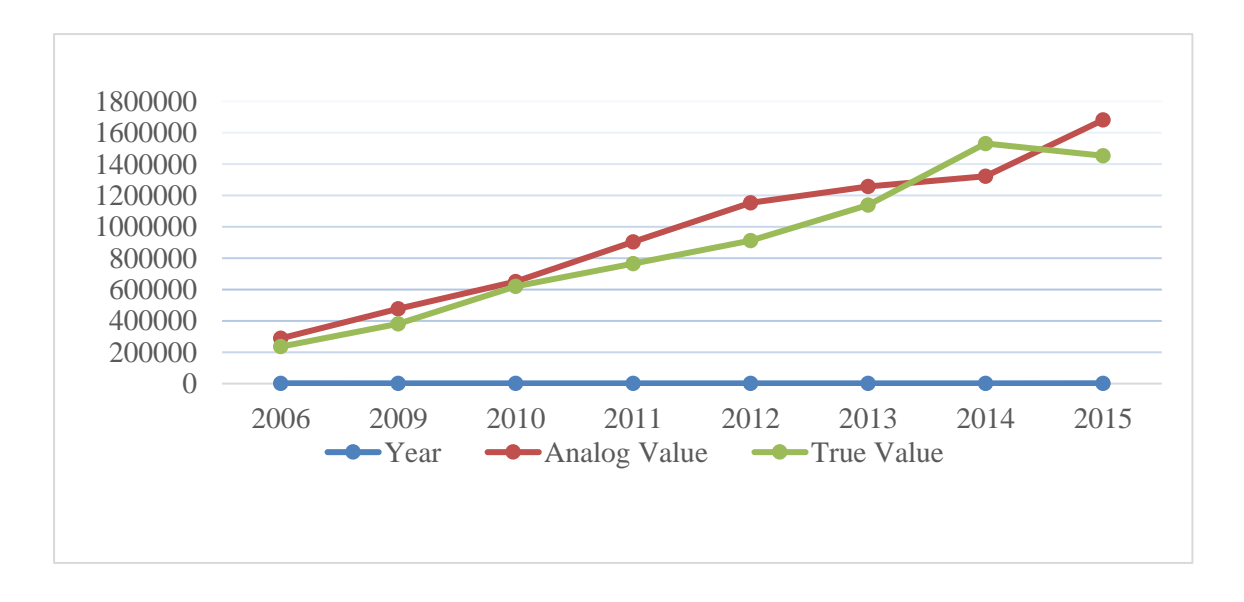
Graph 2: Comparison of Predictive and True Value-2

Notes: Volume means cargo volume via Mohan Border Crossing (tones)