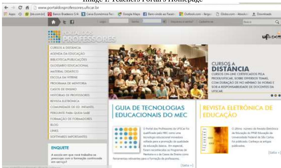
Image 1. Teachers Portal's Homepage

The focus of this text is the website Teachers Portal of the Federal University of São Carlos (UFSCar)( www.portaldosprofessores.ufscar.br ), which is a learning virtual environment dedicated to the continuing education of teachers and the online professional support. The objectives here are to report the experience of the Brazilian Website Portal Teachers of UFSCar, explore the potential and possibilities offered by it to the distance teacher professional development and point challenges to be overcome in the context of distance teacher education. In Image 1, it is possible to see Teachers Portal's homepage.