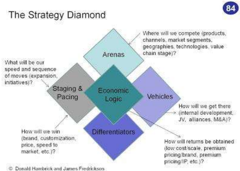
Figure 2: Hambrick's Strategy Diamond