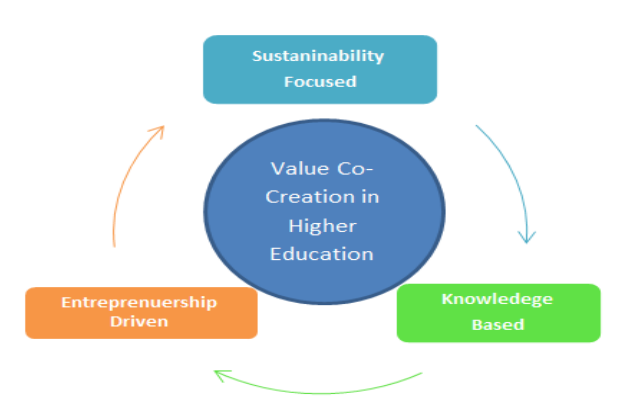
Figure 1:The HEI's centripetal position in Today's societal context (Khalid, 2016)