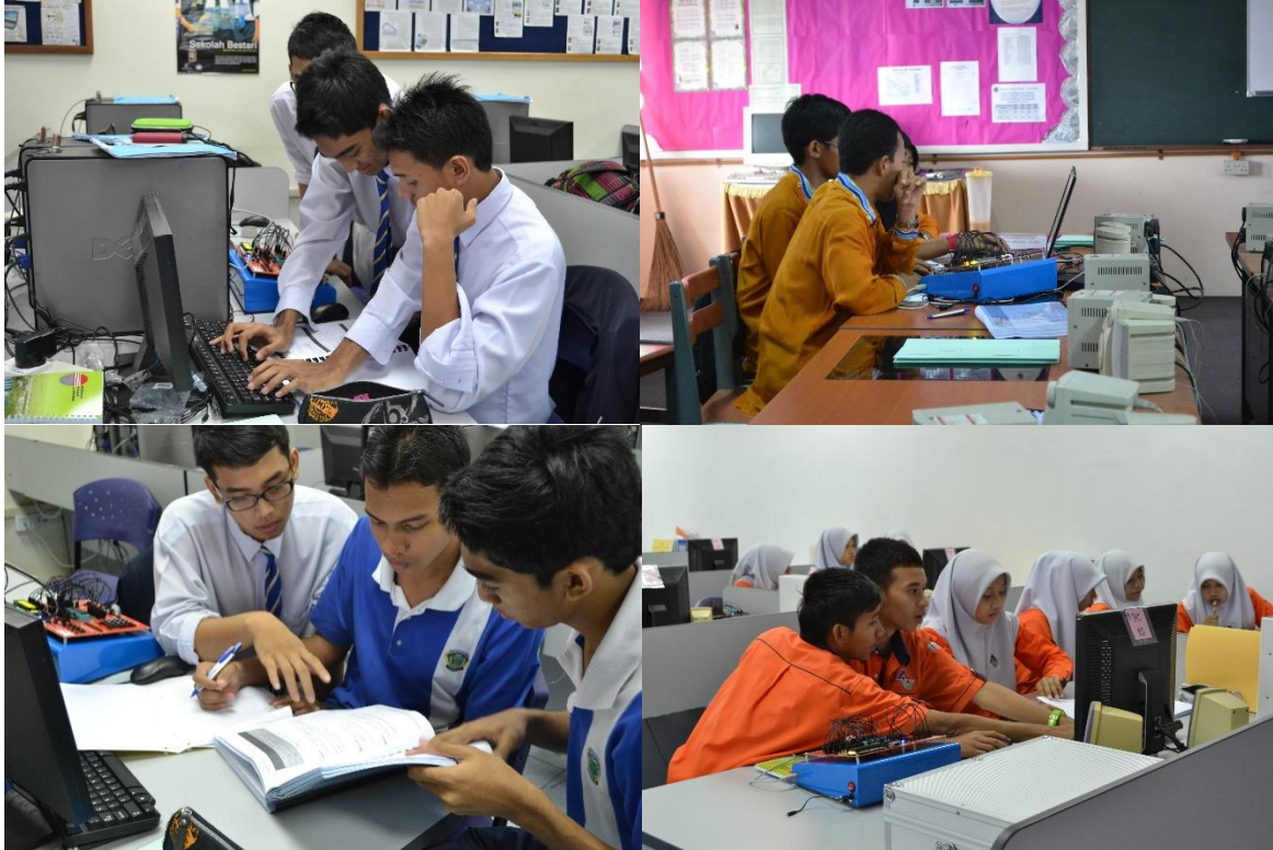
Figure 2: Teaching and Training Session

means they do not have any programming background. The effectiveness of the teaching and learning package are measured by comparing the performance of the two groups. Will the group without programming background performed at par with the group with programming background?