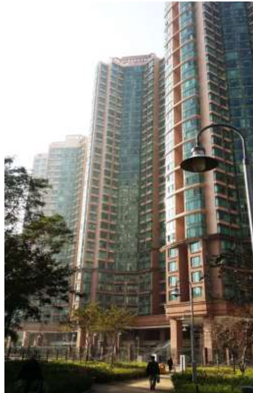
Photo 1: Vista Paradiso