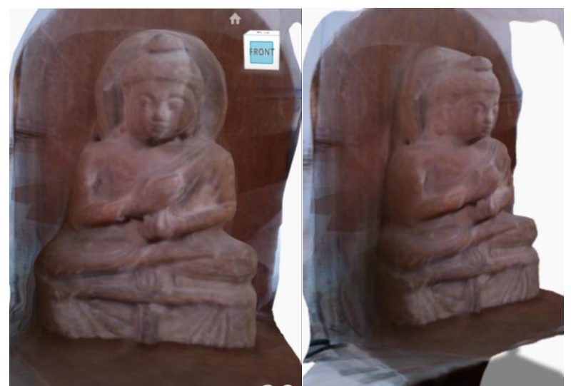
Figure 3: Front and Right view of 'Statue of Buddha'

duplicated during our photography session; leaving exactly 34 photographs for processing on the 123D catch service. In the next step we installed the Autodesk 123D catch application and loaded these 34 photographs into the application in a sequential order for processing into a 3D virtual object. The desktop application took about fifteen minutes to render the 3D object on an Intel Core i3 laptop with 4GB ram. Figure 3 below shows two snapshots of 123D catch application with our digitized 3D heritage object.