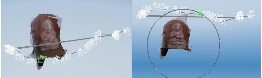
Figure 2: (a, b) Statue of Buddha with camera positions

Since the researchers didn't have a proper photography setup i.e. no sophisticated digital camera and a white backdrop, the objects in these experiments were placed against a white wall for photographs. A five mega-pixel camera from Nokia Lumia 510 mobile was used to photograph during these initial experiments. Every photography session involved a photographer and an additional helper to rotate the heritage object slightly after every photograph. The mobile camera was focused at upper half of the object for first 22 pictures, and the object was rotated slightly after each picture. After the first set of 22 pictures, the mobile was then fixed to focus at lower half of the object and then another set of 22 photographs were taken while rotating the object slightly after every photograph. The figure below shows two pictures of our first real heritage object the 'Statue of Buddha' with cameras pointing (in white color) at different sides of the Buddha statue. The figure 2 (a) and (b) below are 123D catch generated pictures to demonstrates the camera positions during our photography session. Figure 2a shows camera positions at the lower half and figure 2b shows camera positions for the upper half of the object.